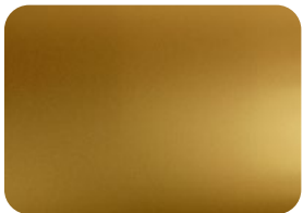
FROMM. Gold color

METAL LIQUID PAINTED (WATER BASED PAINT).