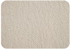
Bouclé Fabric 1730