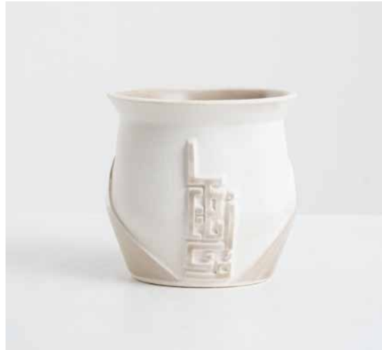
COFFEE CUP Material: Stoneware Dimensions: Ø 7 cm - H 6.5 cm