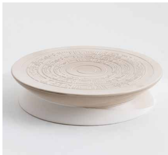
SERVING PLATE Material: Stoneware Dimensions: Ø 35 cm - H 7 cm