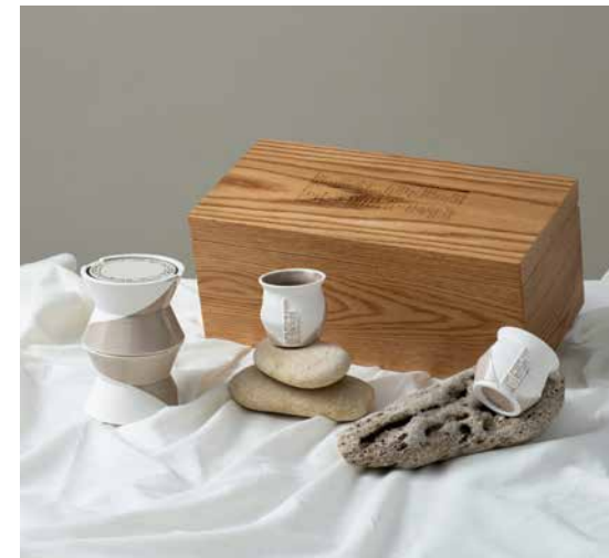
BOX SET Contents: 6 Coffee cups and 1 Mubkhara (incense burner)