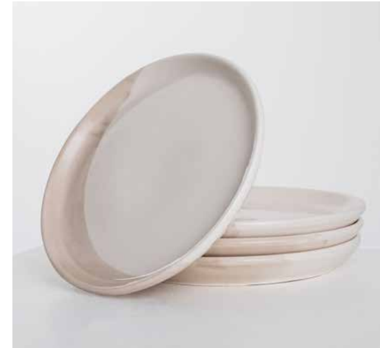
DESSERT PLATE Material: Stoneware Dimensions: Ø 16,5 cm