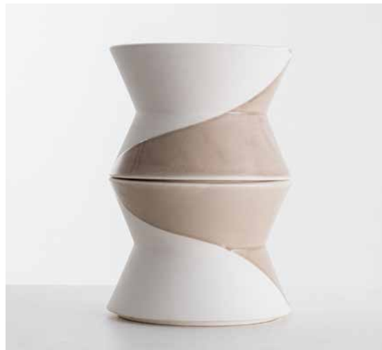
MUBKHARA INCENSE BURNER Material: Stoneware Dimensions: Ø 10 cm - H 13 cm